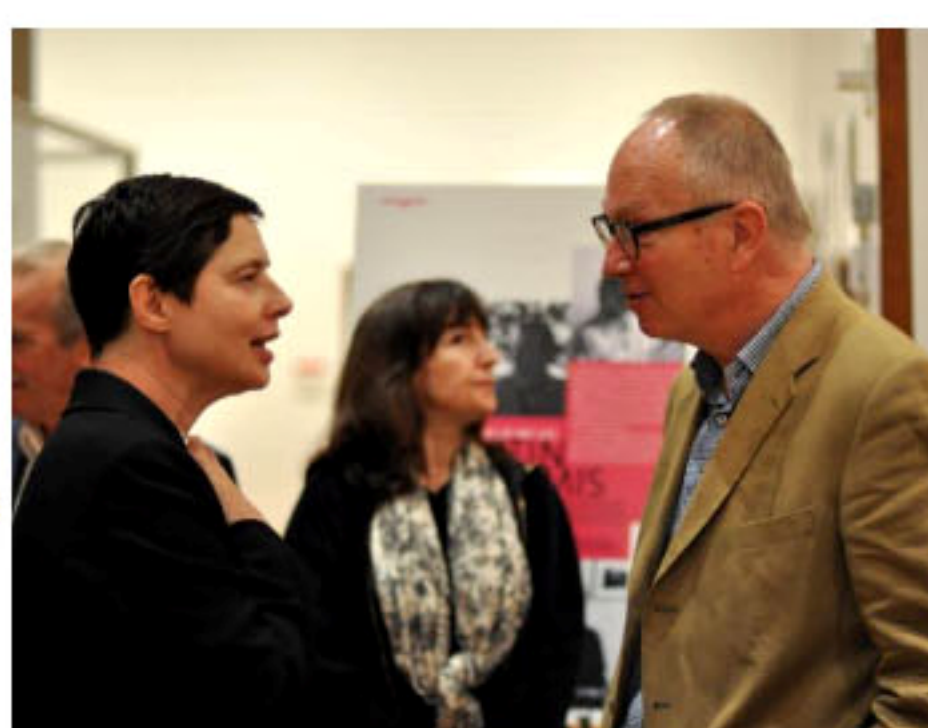
Isabella Rossellini and Ian Buruma @ the Morgan Library