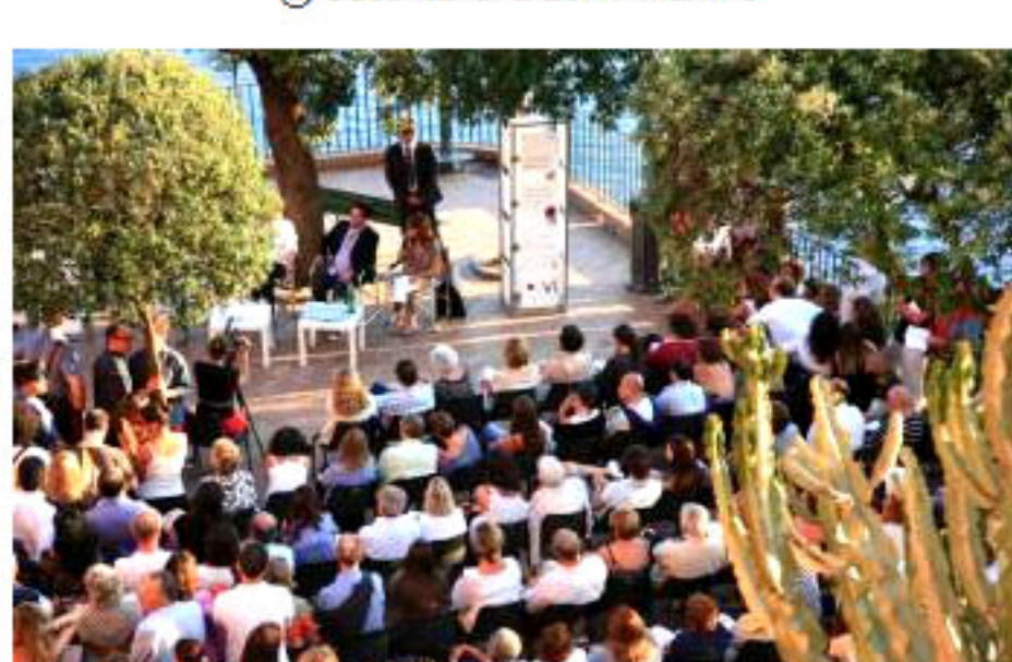
Capri: Le conversazioni